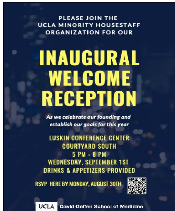
MHO Welcome Reception (in-person)