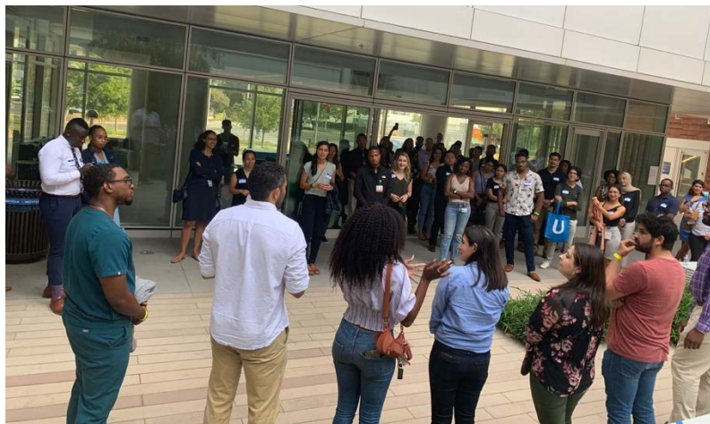
UCLA MHO Quarterly Newsletter