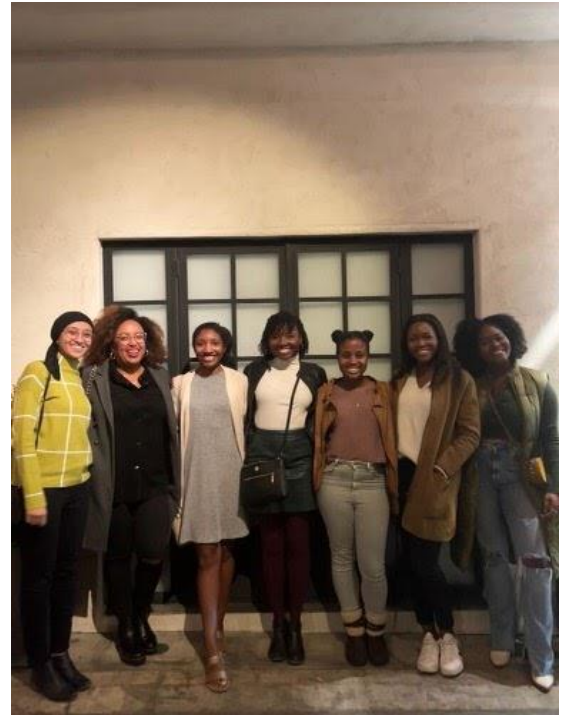
Our excellent pediatrics team enjoying dinner at Fia in Santa Monica.